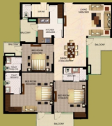
TYPE - 6 (2BHK + SER. ROOM) Tower: D, F, G, N, O T. C. AREA = 1191 SQFT T. CARPET+BALCONY AREA = 1402