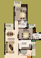
TYPE - 3 (2BHK + STUDY) Tower: H, I T. C. AREA = 829 SQFT T. CARPET+BALCONY AREA = 1024