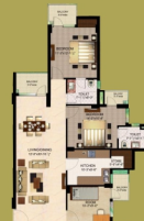
TYPE - 4 (3BHK + 2 TOILETS) Tower: H, I T. C. AREA = 952 SQFT T. CARPET+BALCONY AREA = 1080