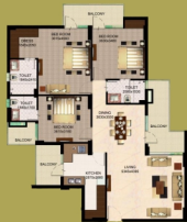
TYPE - 5 (3 BHK + STORE) Tower: D, F, G, N, O T. C. AREA = 1113 SQFT T. CARPET+BALCONY AREA = 1400

Stay Connected to the World, Work & What You Love With Broadband connectivity throughout the complex