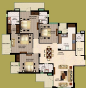
TYPE - 7 (4BHK + SER. ROOM) Tower: D, F, G, N, O T. C. AREA = 1413 SQFT T. CARPET+BALCONY AREA = 1682