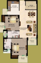
TYPE - 2A (2BHK + ROOM) Tower: E, J, J1 T. C. AREA = 761 SQFT K, L, M, O T. CARPET+BALCONY AREA = 863