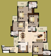
TYPE - 8 (4BHK + SER. ROOM) Tower: A, C T. C. AREA = 1627 SQFT T. CARPET+BALCONY AREA = 1871