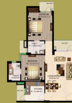
TYPE - 1A (2BHK) Tower: E, J, J1, T. C. AREA = 667 SQFT K, L, M, O T. CARPET+BALCONY AREA = 745