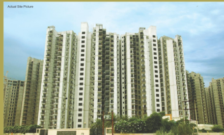
Actual Site Picture